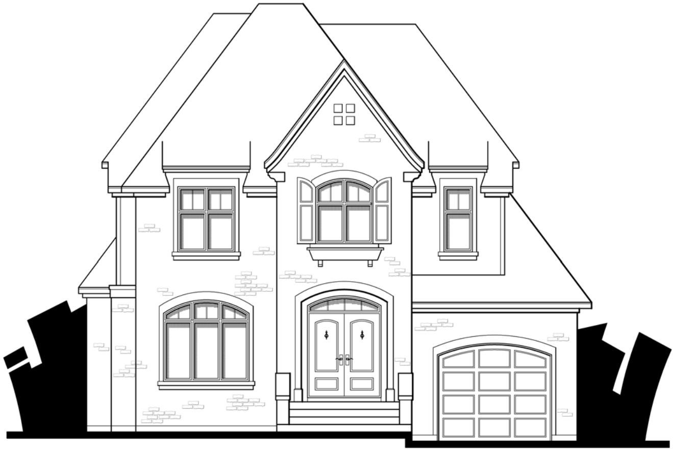
HABITATIONS LUSSIER ESQ-06-270- (C)